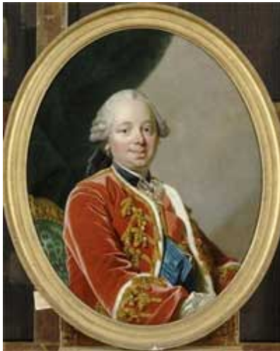
Étienne-François, duc de Choiseul (1719-1785). Secretary of Foreign Affairs (1766-1770).

The French king, through his minister for foreign affairs Étienne-François, duc de Choiseul, FORCED the Pope to dissolve the Jesuits order entirely in the dominions of the Bourbon kings.