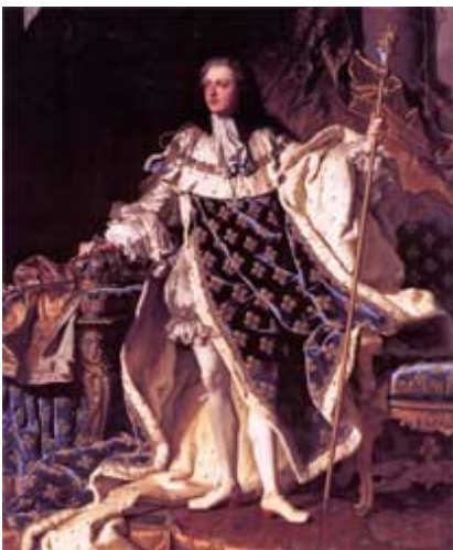
King Louis XV (1710-1774). Reigned from 1715 to 1774.

Madame de Pompadour supported the king's able minister for foreign affairs named Étienne-François, duc de Choiseul, and together they engineered the downfall of the Jesuits in France and the other Bourbon kingdoms of Spain, Portugal, the Two Sicilies, Parma, Naples etc., etc.