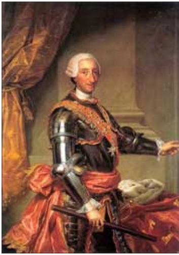
King Charles III of Spain (1716-1788). Reigned from 1759 to 1788.

monarch was a foe of the Jesuits and the Spanish Inquisition.