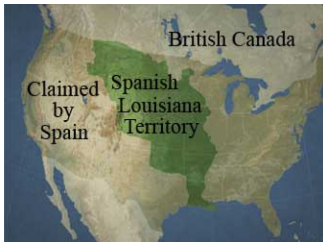
Map of the New World AFTER the Seven Years' War ended in 1763.

His slogan was: ONE DOWN . . . ONE TO GO... In other words, Spain now had only one