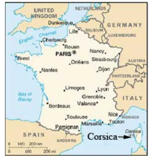
Island of Corsica, just south of France, was a haven for the Jesuits.

The Papal States refused to receive them and they ended up on the French owned island of Corsica.