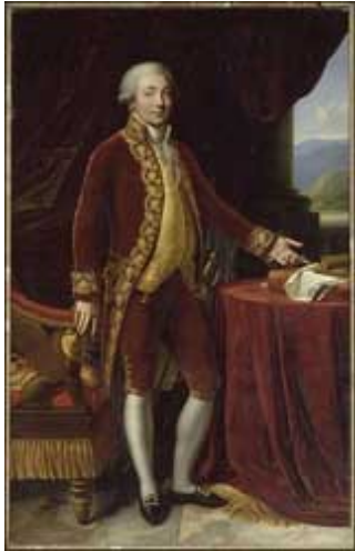
Carlo Maria Bonaparte (1746-1785).

The world was told that Carlo Maria Bonaparte was the father of Napoleon. He could not possibly be the REAL father. The Jesuits were famous or rather infamous for seducing the wives of kings and rulers in the confessional. The offspring of such unions were often passed off as legitimate children.