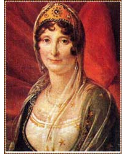
Maria Letizia Bonaparte (1750-1836).

This was plainly the case in the birth of Bonaparte.