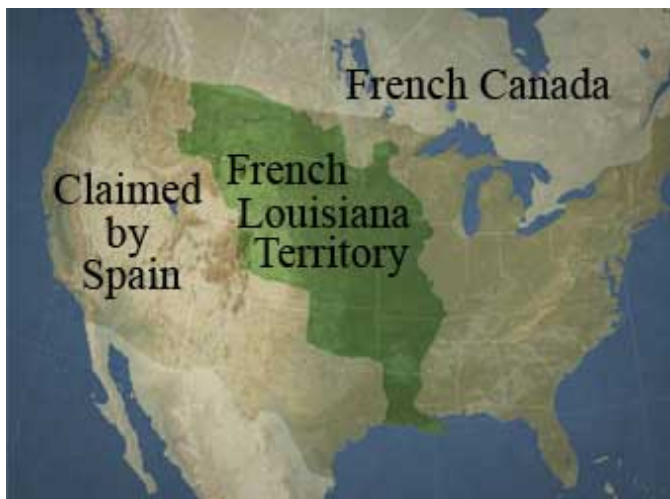
Map of the New World BEFORE the Seven Years' War.

The first shots of this worldwide conflict in the New World were fired by a youthful George Washington, who was sent on an expedition against the French in the Ohio country, a region claimed by Virginia. Great Britain declared war on France in May, 1756, and eventually the conflict spread to the whole world. Almost a million people died before a peace treaty was signed in 1763.