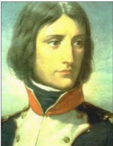
Napoleon Bonaparte (1769-1821) shown here as a young officer.

This was plainly the case in the birth of Napoleon as his subsequent career plainly reveals. The war loving Napoleon declared war on all the Bourbon kings that had banished the Jesuits. He tried to bring England to her knees and invaded Russia in 1812. He finally restored the Jesuits in 1814.