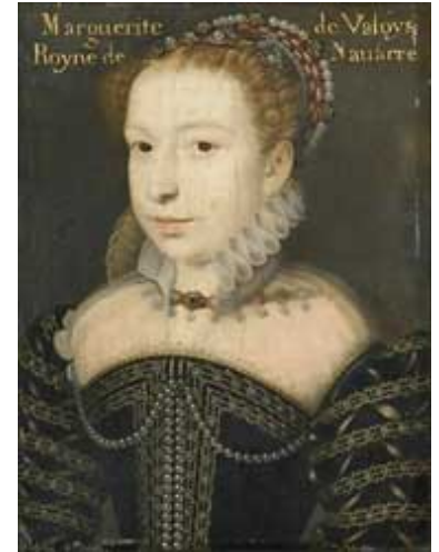
Marguerite de Valois (1553-1615). Wife of King Henry IV.

King Henry VI granted religious tolerance to his French Protestant subjects in 1589.