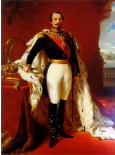
Napoleon III (1808-1873). Emperor of the French from 1852 to 1870.

Even after the demise of Bonaparte, his dynasty continued to rule many of the countries of Europe. Here are just 2 of the Bonapartes who played a major role in world events.