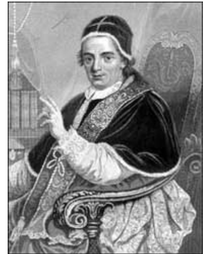
Pope Clement XIV (1705-1774). Pope from 1769 to 1774).

He finally relented and in 1773 issued a Bull suppressing them PERPETUALLY and FOREVER.