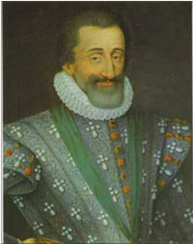
King Henry IV (1553-1610). Reigned from 1589 to 1610).

As a Huguenot, Henry was involved in the Wars of Religion before ascending to the throne in 1589. In 1598 he enacted the Edict of Nantes which guaranteed religious liberties to the Protestants and thereby effectively ended the civil war.