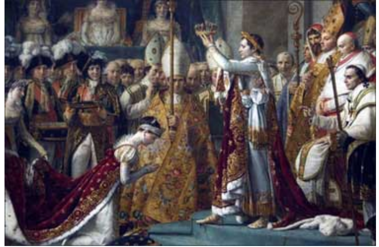
Coronation of Napoleon on December 2, 1804, at Notre Dame de Paris.

At Napoleon's beck and call he journeyed to Paris to crown Napoleon Emperor.