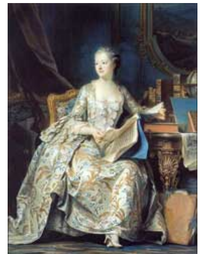
Madame de Pompadour (1721 -1764).

That move cost Madame de Pompadour her life as she died of poison at the young age of 43.