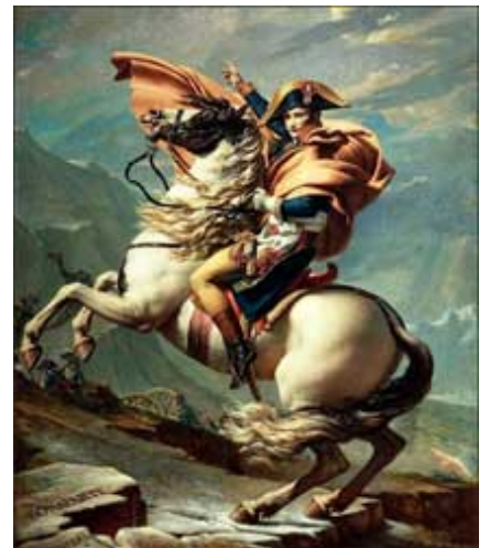
Napoleon the warrior crossing the Alps.

He made war on all the Bourbon kings; he declared war on England, invaded Russia, and last but not least had the Jesuits restored in 1814.