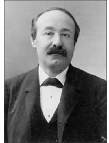
Charles Joseph Bonaparte (1851- 1921). U.S. attorney general from 1906 to 1909.

Charles Joseph Bonaparte founded the Bureau of Inquisition which later became known as the FBI or "Federal" Bureau of Inquisition!!