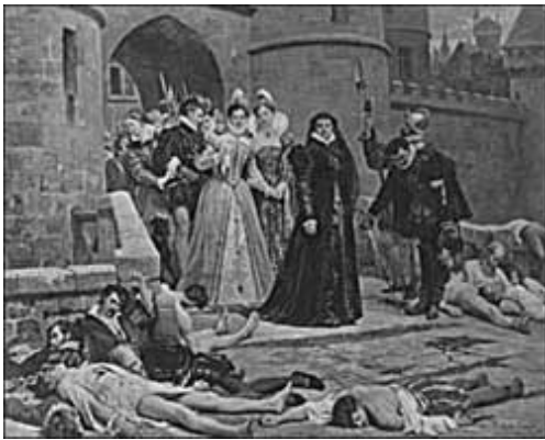
Catherine de' Medici exults over the dead bodies of the Huguenots.

The gracious Queen Elizabeth encouraged French emigration to the New World and she gave financial aid to the persecuted French Protestants.