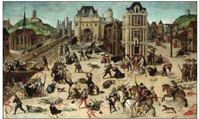
Blood flowed like a river in the streets of Paris.

Total victims numbered over 100,000 throughout France.