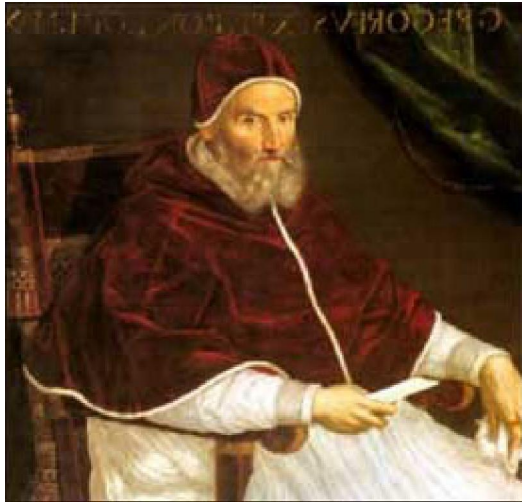
Pope Gregory XIII (1502-1585). Pope from 1572 to 1585.