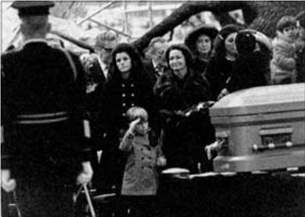
Johnson had a state funeral in Washington City and Austin, Texas.

He knew too much however, and with the drama of Rockefeller for President unfolding before his very eyes, he might inadvertently say something. That is why he had a very timely demise because dead men tell no tales: