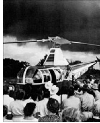
Johnson had unlimited funds and he campaigned by helicopter all over Texas in what the rural folks called The Flying Windmill.

Johnson was definitely going to lose to the popular Texas ex-governor, so his cronies stuffed the ballot box in Jim Wells County: