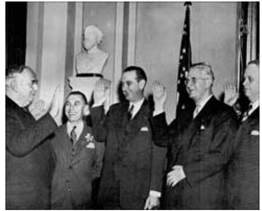
A happy "Lyn" Lyndon is sworn in as U.S. Senator on January 3, 1949.