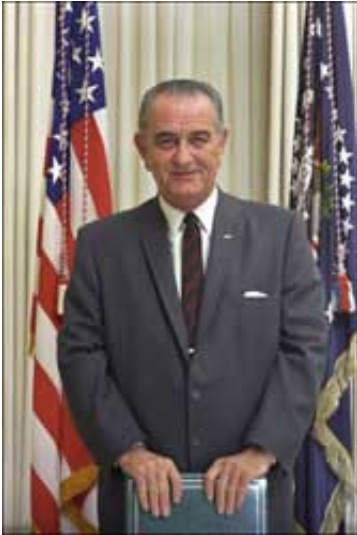
Lyndon Baines Johnson (1908-1973). President from Nov. 1963, to Jan. 1969).

Believe it or not Rome actually loves corrupt politicians....In her estimation, the more corrupt you are the more you are fitted for very HIGH office!!