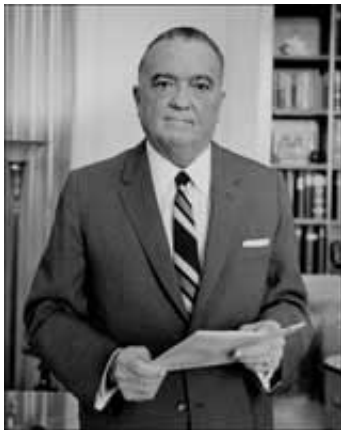
J. Edgar Hoover (1895-1972). Head of the FBI—Federal Bureau of Inquisition.