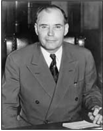
Governor Coke Stevenson (1888-1975). Governor of Texas from 1941 to 1947.