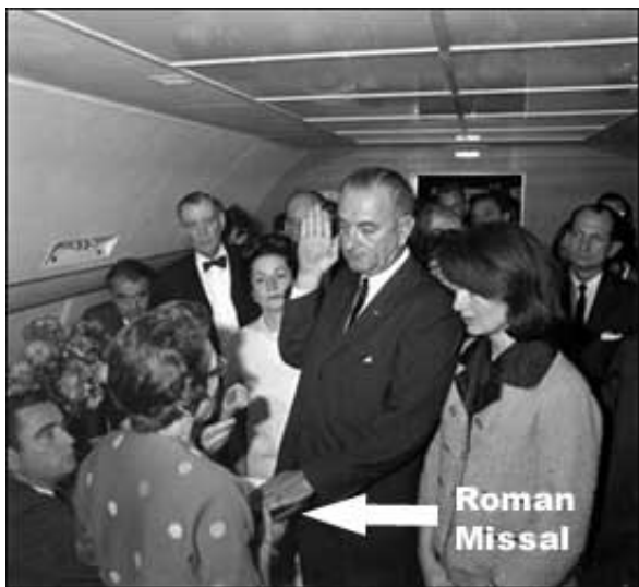
Vice President Johnson with his hand on a Roman missal. Notice now calm Jackie as her dead husband is lying nearby in a coffin!!

Instead of a Bible, Johnson took the oath of office on a Roman Catholic missal—a book containing all the prayers and responses necessary for celebrating the mass throughout the year.