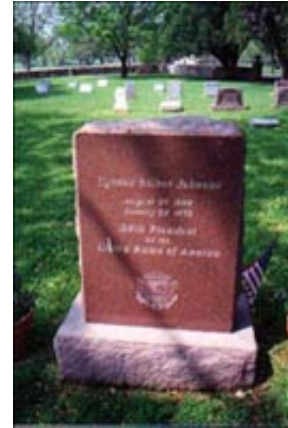
Johnson's grave at the LBJ ranch in the Johnson family cemetery.

The 65 year old Johnson suffered a fatal heart attack on Jan. 22, 1973, while resting at his ranch in Johnson City, Texas. Two days later, he was given a state funeral in Washington City and Austin, Texas, before interment in the family cemetery on the LBJ ranch.