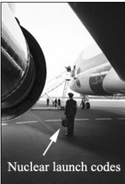
Nuclear launch codes.

Rockefeller was checkmated in his attempt to steal the Presidency—but only for a while. He would try again using the Vietnam War and the assassination of President Kennedy in order to amend the Constitution in order to allow the President to appoint his successor.