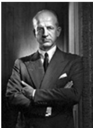
Sumner Welles (1892-1961). Under Secretary of State from 1937 to 1943).

The Reason why President Truman changed the Succession Act in 1947!!