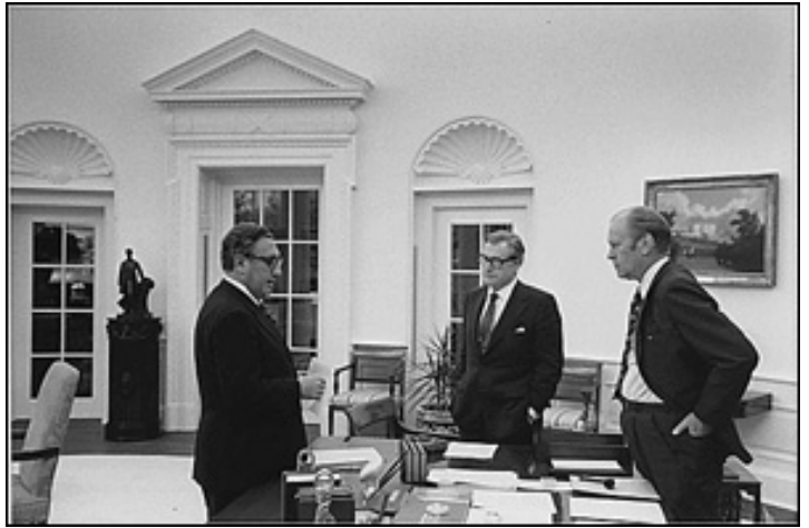
Rockefeller in the White House Oval Office with President Ford and Kissinger.

Rockefeller was indeed only one heartbeat away from the Presidency when he served as Vice President under President Ford.