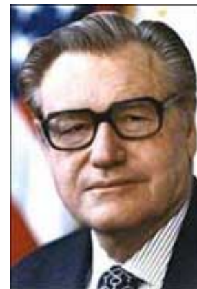
Nelson Rockefeller (1898-1979). Under Secretary of State from 1944 to 1945.