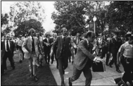
Activity following the attempt on President Ford's life by Lynette "Squeaky" Fromme, in Sacramento, California, September 5, 1975.

Two weeks later in San Francisco, on September 22, Sara Jane Moore, aged forty-five, a one-time FBI informer, fired a .38 revolver at Ford. The shot missed Ford by a few feet because a bystander had spoiled her aim. Both women were convicted under the 1965 law making attempted assassination of the President a federal offense punishable by life imprisonment.