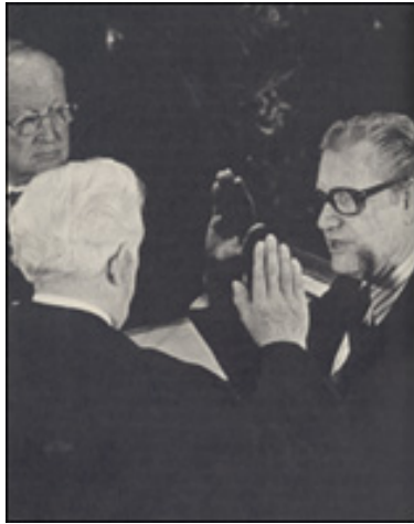
Nelson Rockefeller was sworn in as Vice President on Dec. 19, 1974.

Rockefeller was sworn in as Vice President Dec. 19, 1974. He was now only a heartbeat away from his lifelong ambition to be king of the United States.