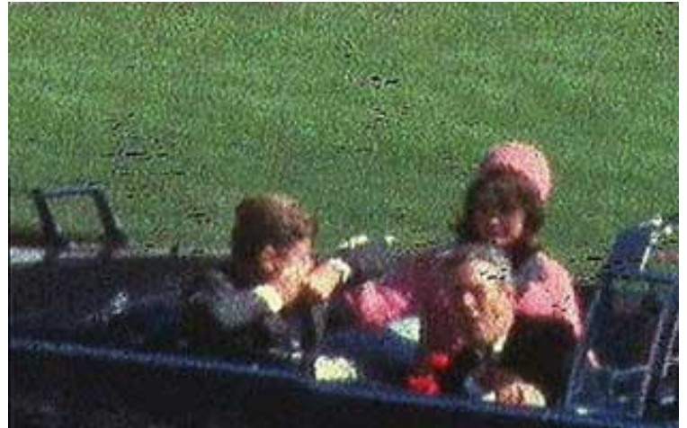
The assassination of President Kennedy took place in Dallas, Texas, on Nov. 22, 1963.

President Kennedy was very popular with the people and he would have been elected for a second term in 1964. Rockefeller was not going to let ANYTHING stand in his way to the White House so he gave the order for Kennedy's assassination. This was carried out in Dallas, Texas, on Nov 22, 1963.