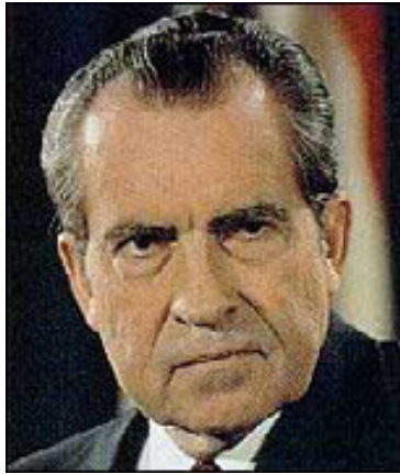
President Nixon (1913-1994). President from 1969 to '74.