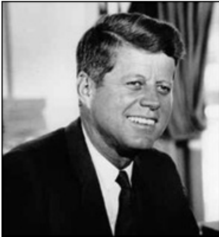
John Fitzgerald Kennedy (1917-1963). President of the U.S. from Jan. 20, 1961 to Nov. 22, 1963.