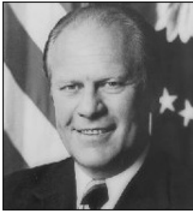
President Gerald Ford (1913-2006). (President of the U.S. from August 9, 1974, to Jan. 20, 1977).

Rockefeller was sworn in as Vice President Dec. 19, 1974. He was now only a heartbeat away from his lifelong ambition to be king of the United States.