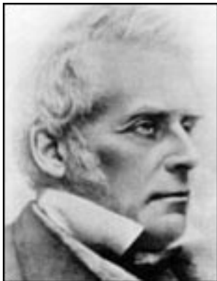
John Nelson Darby. (1800 to 1882).

Prior to Darby, all Protestant Christians believed that the Book of Revelation was a history of the Christian congregation from the first century to the end of time.