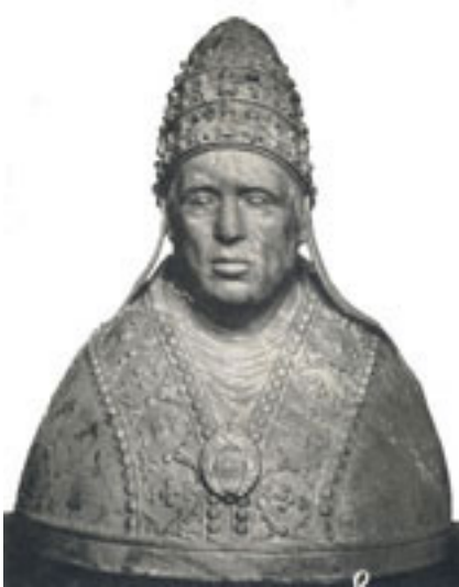
Pope Alexander VI. 1431 to 1503. Pope from 1492 to 1503.

Now that Satan had created his masterpiece called the Spanish Inquisition, it was time to present it to the world.