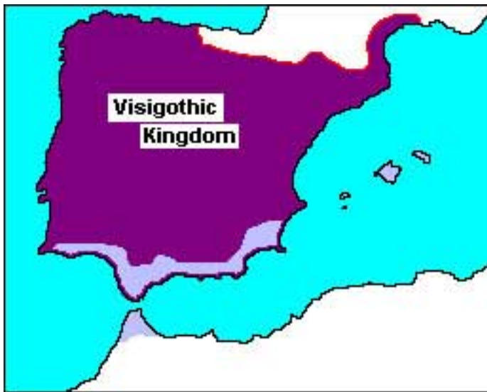
Visigothic kingdom of Spain from around 500 A.D. to 711.

"Such was the condition of Spain when the Mussulman approached her borders. A corrupt aristocracy divided the land among themselves ; the great estates were tilled by a wretched and hopeless race of serfs ; the citizen classes were ruined. On the other side of the straits of Gibraltar were the soldiers of Islam, all hardy warriors, fired with the fervour of a new faith, bred to arms from their childhood, simple and rude in their life, and eager to plunder the rich lands of the infidels. Between two such peoples there could be no doubt as to the issue of the fight; but to remove the possibility of doubt, treachery came to the aid of the invaders." (Stanley Lane-Poole, The Story of the Moors in Spain , p. 8).