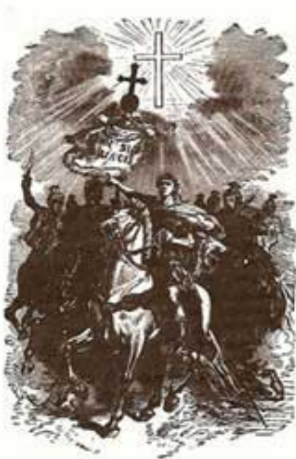
Constantine and his counterfeit "heavenly vision."

"Accordingly he (Constantine) called on him with earnest prayer and supplications that he would reveal to him who he was, and stretch forth his right hand to help him in his present difficulties. And while he was thus praying with fervent entreaty, a most marvelous sign appeared to him from heaven, the account of which it might have been hard to believe had it been related by any other person. But since the victorious emperor himself long afterwards declared it to the writer of this history, when he was honored with his acquaintance and society, and confirmed his statement by an oath, who could hesitate to accredit the relation, especially since the testimony of after-time has established its truth? He said that about noon, when the day was already beginning to decline, he saw with his own eyes the trophy of a cross of light in the heavens, above the sun, and bearing the inscription, CONQUER BY THIS. At this sight he himself was struck with amazement, and his whole army also, which followed him on this expedition, and witnessed the miracle." (Eusebius, Life of Constantine , p. 490).