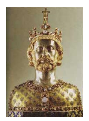
Charlemagne reigned as king of the Franks from 768 to 800, and as unholy Roman emperor from 800 to 813.

Empress Irene (753-803) was the only female to ever rule at Constantinople. She was the Eastern empire's equivalent to Pope Joan.