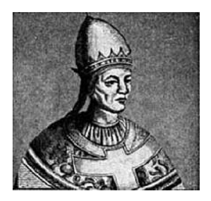
Pope Gregory VII. Pope from 1073 to 1085.

This move by the Vatican to create another Roman emperor was a disastrous decision. A current analogy would be if the United States had 2 rival Presidents.