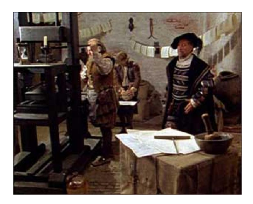
Luther's Wittenberg press.

Saint Martin's press threw OCEANS of ink at the devil.