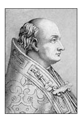
Pope Leo III. Pope from 795 to 816.

Printing from movable type was also invented in Germany and this would ensure the rapid dissemination of the Word of God.