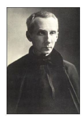
Pope Benedict XV (1854 to 1922). White Pope from 1914 to 1922.

General Ledochowski was a fanatical supporter of World War I Kaiser William II.