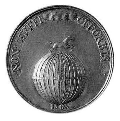
The world was not enough for the Spanish Inquisition!!

This was no idle boast with the Spanish monopoly of the unlimited riches of the New World.