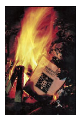
Flames devour the Papal Bull.

Saint Martin answered the challenge by officially excommunicating the <u>Latin kingdom</u> from Christ's Congregation forever: