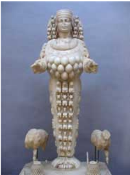
Statue of Diana of the Ephesians.

"But if ye inquire any thing concerning other matters, it shall be determined in a lawful ASSEMBLY ( ekklesia )" (Acts 19:39).