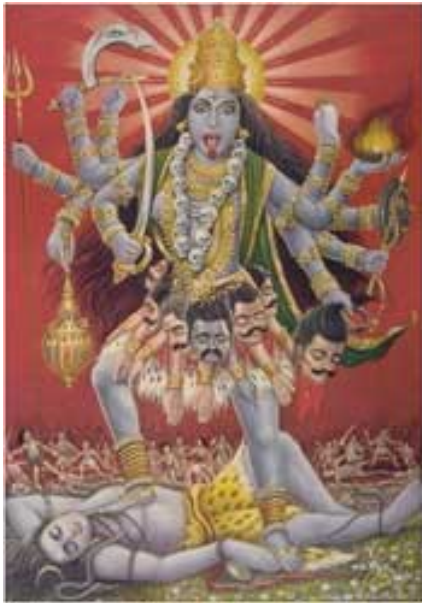
Kali, the cruel mother goddess of India, with a necklace of human skulls.