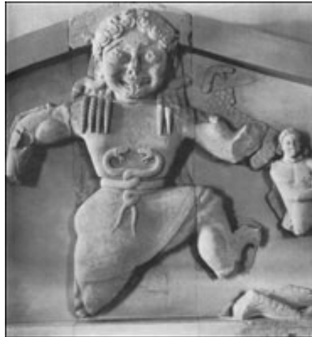
Medusa, the goddess of the hissing serpents, was another name for Diana or Circe. This goddess changed all who looked at her into STONE!!