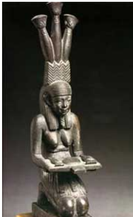
Egyptian god "Hapi" (male)

Changing a man into a woman goes back to ancient Egypt. Egyptian gods and goddesses were BISEXUAL perverts: