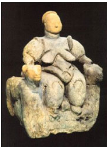
The moon goddess Allah with her hands on the backs of 2 leopards. This statue was found in Catal Huyuk , Turkey, near the city of Ephesus.