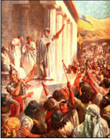
Paul preaching the Risen Christ to the pagan ekklesia at Ephesus located in present day Turkey.

Jesus the Son of God sent St. Paul to destroy this deadly worldwide Satanic counterfeit at its headquarters in Ephesus.