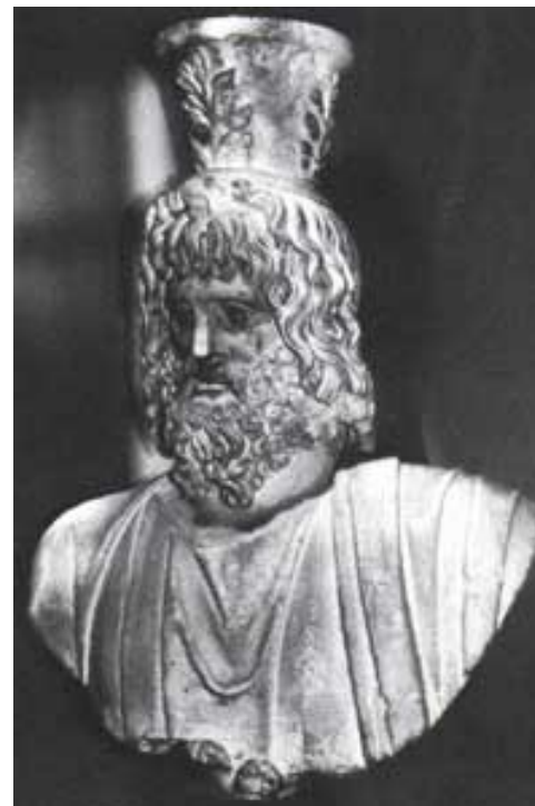
Serapis was the Greek version of