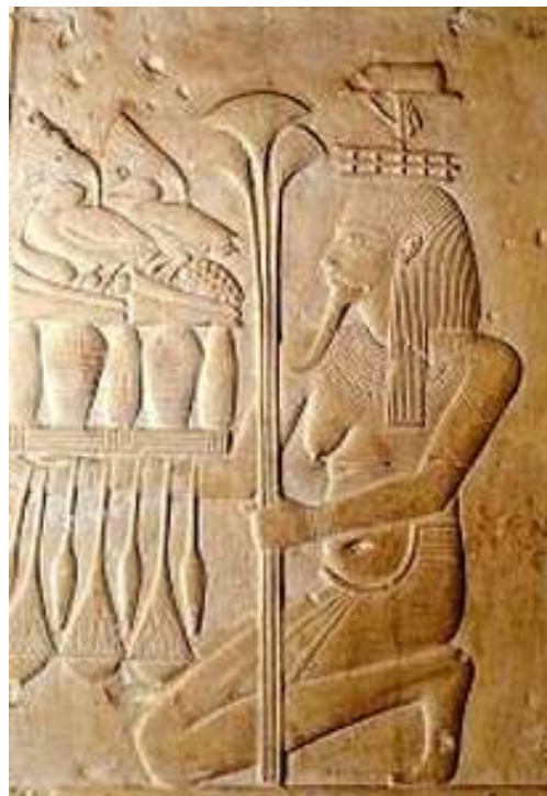
Another image of Hapi with a