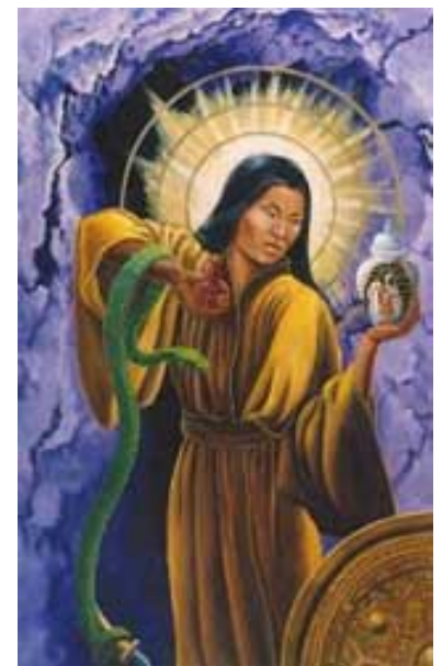
Japanese SON goddess Amaterasu.

Japan is unique because the goddess was always associated with the MOON. The Japanese