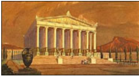
Temple of Diana (Artemis) at Ephesus was one of the 7 wonders of the ancient world.

Diana of the Ephesians was another name for Circe. This MOTHER OF GOD demon was also called Istar, Astarte, Isis, Artemis, Aphrodite, Medusa, Demeter, Venus, Kali, Coatlicue etc., etc.