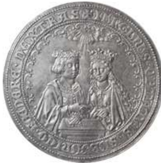
A medallion struck to commemorate the marriage of Henry VII and Elizabeth of York in January 1496, which unified the rival houses of York and Lancaster

The royal happy couple believed in making love . . . and not war!!