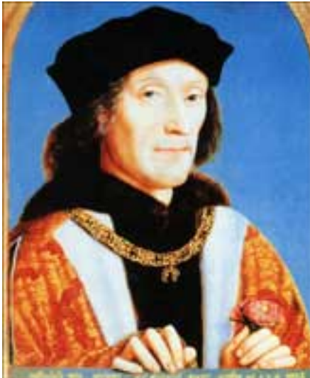
King Henry VII (1457-1509). A victim of the poison cup !!