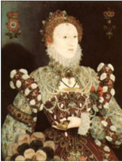
Queen Elizabeth I (1533-1603) , daughter of Anne Boleyn.

Gloriana—the virgin Queen Elizabeth I—became Queen on Nov. 17, 1558. She reigned for 45 years and those years were the most momentous in world history.