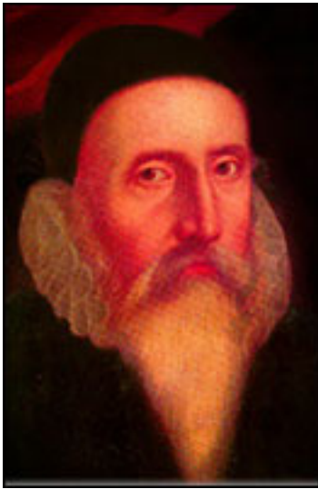
John Dee (1527-1608) was the spy master for Queen Elizabeth I.

John Dee was the original 007. After the Bull of Excommunication in 1570, Queen Elizabeth's life was in constant danger from domestic and foreign enemies.