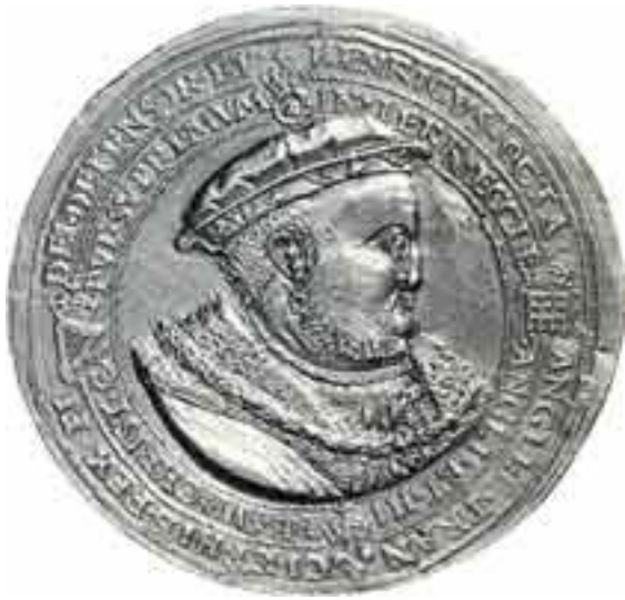
Medal of Henry as Defender of the Faith issued in 1545.

It was God's plan to prolong the life of King Henry VII until the end of the Babylonian Captivity of the Congregation in 1517.