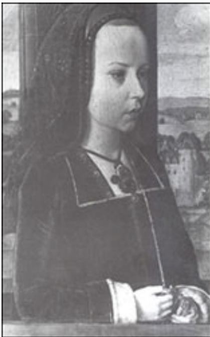
Margaret of Austria (1480-1530), Duchess of Savoy was one of the young prospective brides for Henry VII.

"His body was slender but well built and strong; his height above the average. His appearance was remarkably attractive and his face was cheerful, especially when speaking; his eyes were small and blue, his teeth few, poor and blackish ; his hair was thin and white; his complexion sallow. His spirit was distinguished, wise and prudent; his mind was brave and resolute and never, even at moments of the greatest danger, deserted him" (Vergil, Anglica Historia , p. 145).