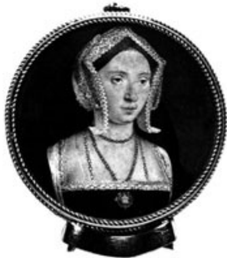
Anne Boleyn (1500-1536) as a young lady of 25.

As we stated before, Henry was a PARTY ANIMAL and had an eye for beautiful ladies. Anne Boleyn was one such beautiful and brainy lady. She was educated in France at the court of Marguerite of Valois, the sister of Francis I.