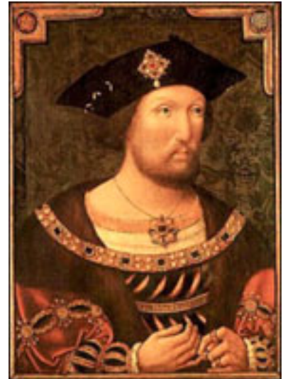
King Henry VIII (1491-1547).

The future King Henry VIII just turned 18 on June 28, 1509. This was the age of majority for the royal succession. The timing of the death of his father was impeccable!!