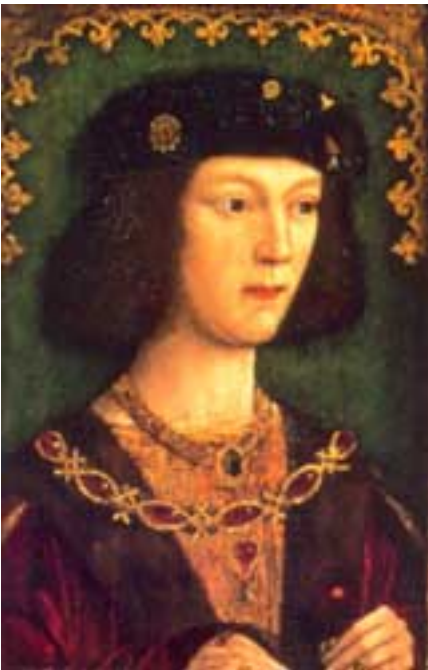
Prince Henry (1491-1547), when he was Duke of York.

At this point in time, Catherine should have packed her bags and returned to Spain but control of an entire New World was at stake and she was forbidden to return.... She was told to set her eyes on Henry—the younger brother of Arthur— and later to become the infamous King Henry VIII.