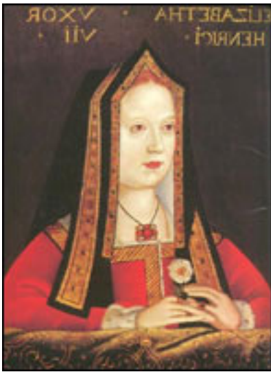
Elizabeth of York (1466-1503), wife of King Henry.

In 1486, he married the beautiful princess Elizabeth of York who belonged to a rival dynasty. Henry sought to heal ancient rifts and end dynastic wars.